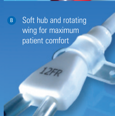
B Soft hub and rotating wing for maximum patient comfort