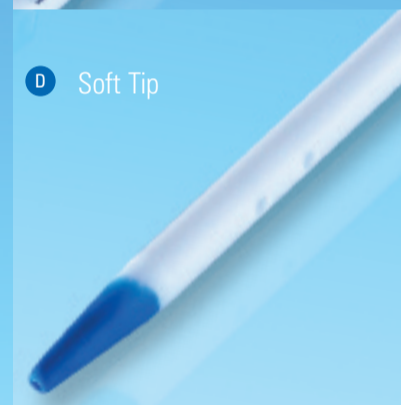
D Soft Tip