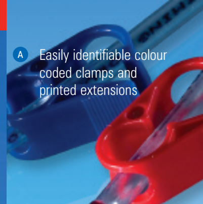
A Easily identifiable colour coded clamps and printed extensions