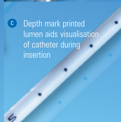
C Depth mark printed lumen aids visualisation of catheter during insertion