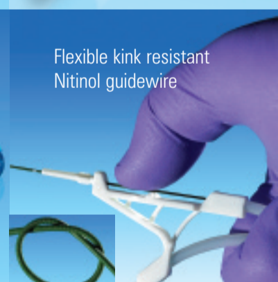
Flexible kink resistant Nitinol guidewire