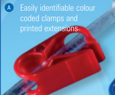
A Easily identifiable colour coded clamps and printed extensions