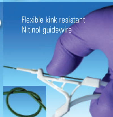
Flexible kink resistant Nitinol guidewire