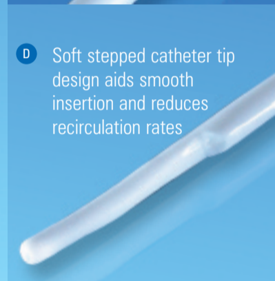
D Soft stepped catheter tip design aids smooth insertion and reduces recirculation rates