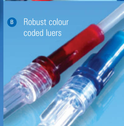
B Robust colour coded luers