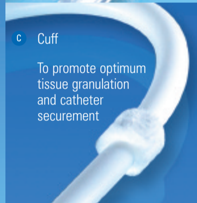
C Cuff To promote optimum tissue granulation and catheter securement