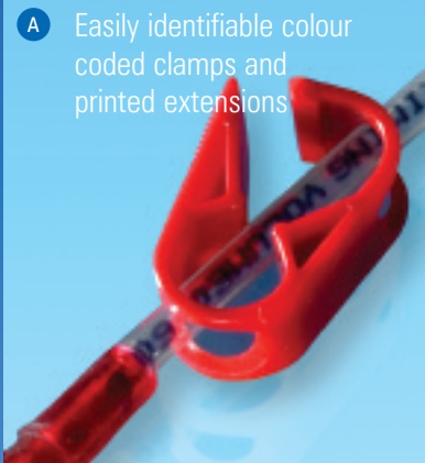
A Easily identifiable colour coded clamps and printed extensions