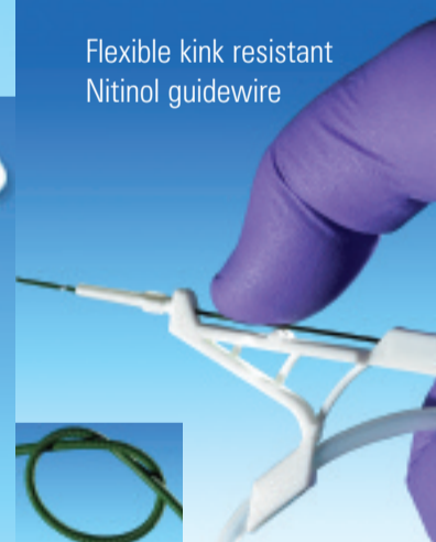
Flexible kink resistant Nitinol guidewire