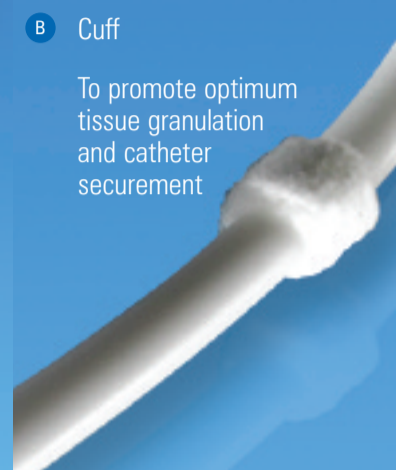
B Cuff To promote optimum tissue granulation and catheter securement