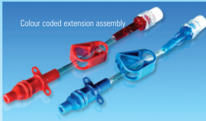
Colour coded extension assembly