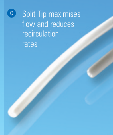
C Split Tip maximises flow and reduces recirculation rates