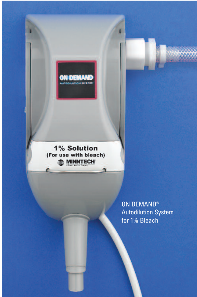
ON DEMAND® Autodilution System for 1% Bleach