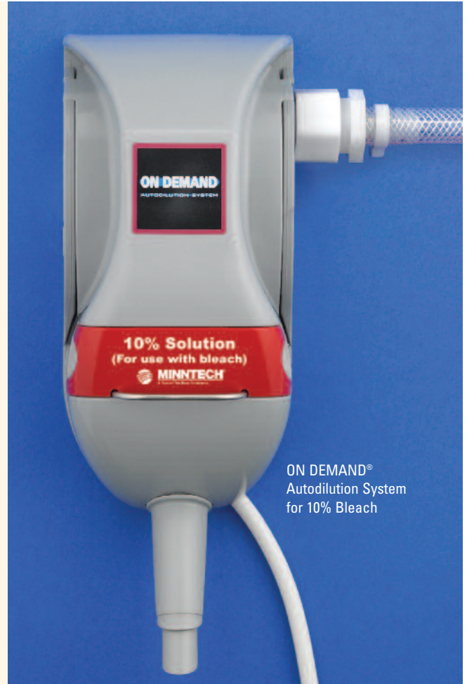
ON DEMAND® Autodilution System for 10% Bleach